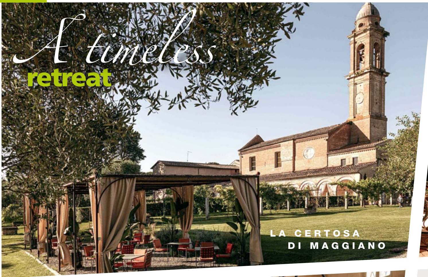
LA CERTOSA DI MAGGIANO